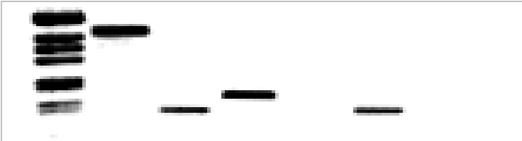
Figure 1. SRY, X and Y PCR amplification gel profile. Lane 1, molecular weight marker. Lanes 2-4 male DNA, lanes 5-7 female DNA. Lanes 2 and 5 SRY amplification, lanes 3 and 6 X amplification, lanes 4 and 7 Y amplification. Note the absence of amplification of SRY and Y from female DNA (lanes 5 & 7).